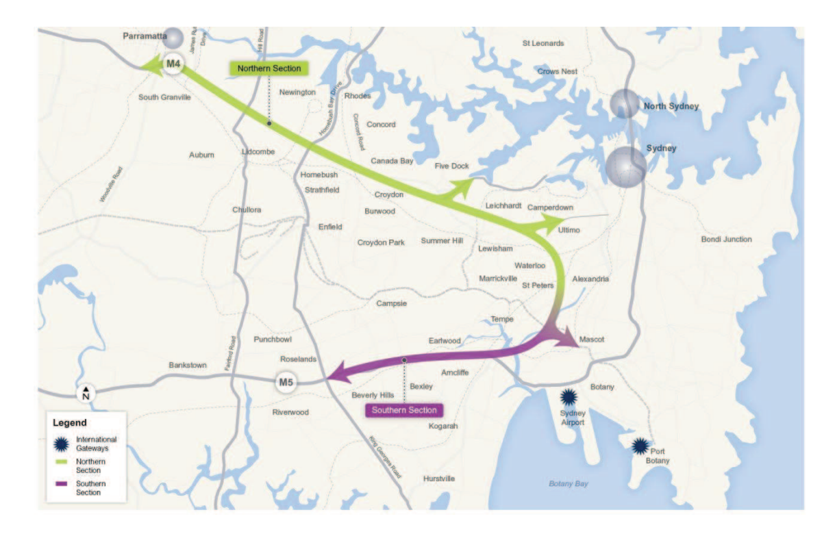
Figure 3: WestConnex - Northern and Southern Sections

WestConnex preserves options for future northerly and southerly extensions of the Sydney motorway network, and future enhancements around the north of Sydney Airport to connect to Port Botany. This is consistent with the vision set out for Sydney motorways in the DLTTMP and SIS as shown in Figure 2.