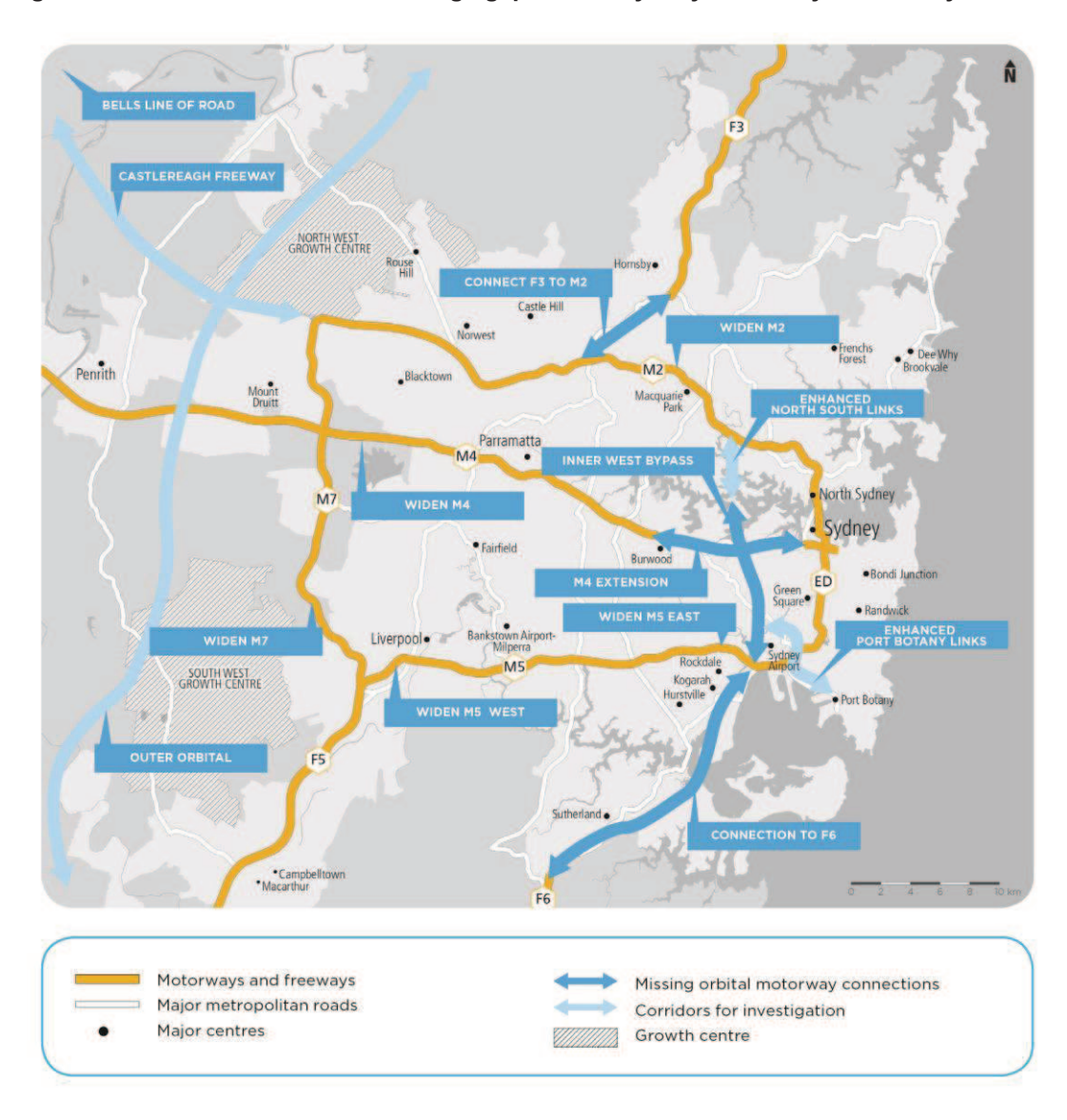
Figure 2: Potential connections to bridge gaps in the Sydney motorway network by 2031