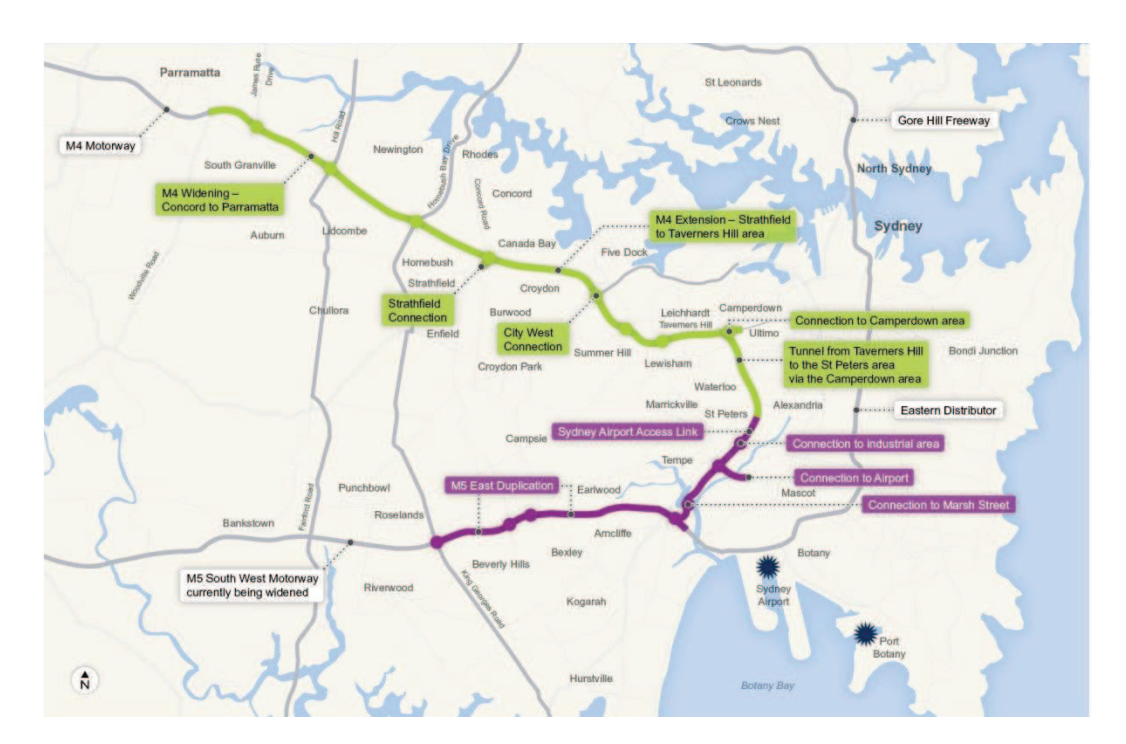
Figure 1: WestConnex - Core elements and connections

The project generates a benefit to cost ratio (BCR) of over 1.5, meaning economic benefits to users are over 1.5 times the costs. This analysis provides compelling support to prioritise the project from an economic perspective.